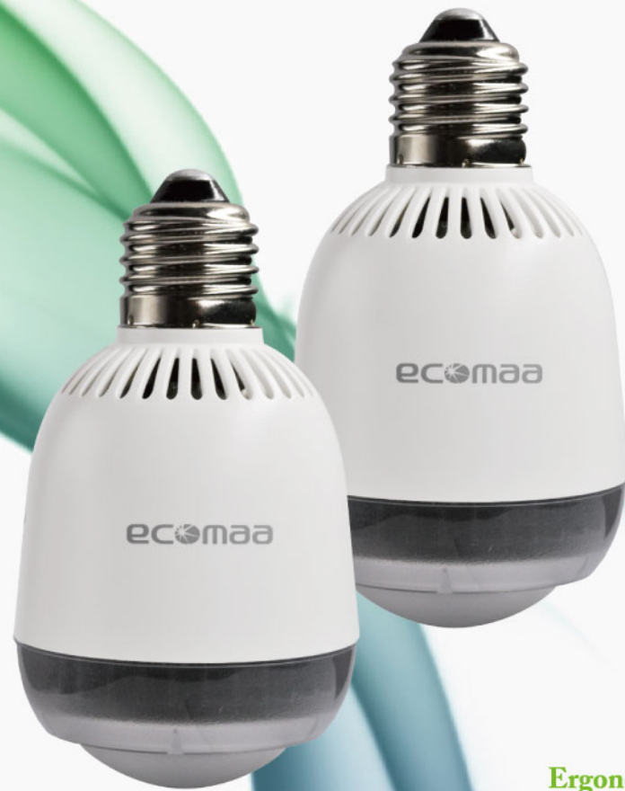
EL1301 Lamp I