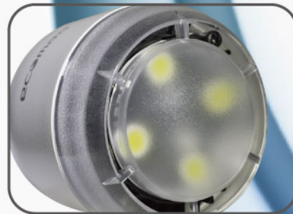
EL1301 Front View

Ergonomic design to create a classic ambience in your own surroundings