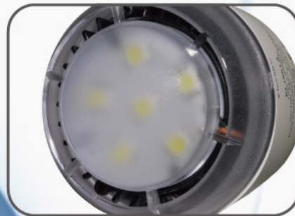
EL1001 Front View